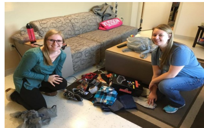
Purchasing Christmas presents for Adoptive and Foster Families of Maine, Inc.