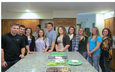
Cooking dinner at the Ronald McDonald House in Bangor