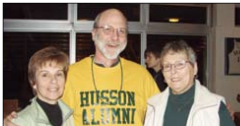
Indoor tailgate party celebrating Husson Eagles men and women's basketball teams.

teams were cheered on by alumni. An indoor tailgate party for all alumni, friends and family was generously sponsored by Merrill Bank. A lucky alumna went home with a gift certificate for dinner from Paddy Murphy's.