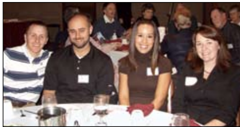
Aroostook County Alumni gathering at the Caribou Inn and Convention Center

Husson alumni, families, and friends gathered for a wonderful dinner on November 1, 2007 at the Caribou Inn and Convention Center. It was a great opportunity to share Husson experiences and hear about the current transformation of the campus and programs not only in Bangor, but in Portland and Presque Isle as well. The