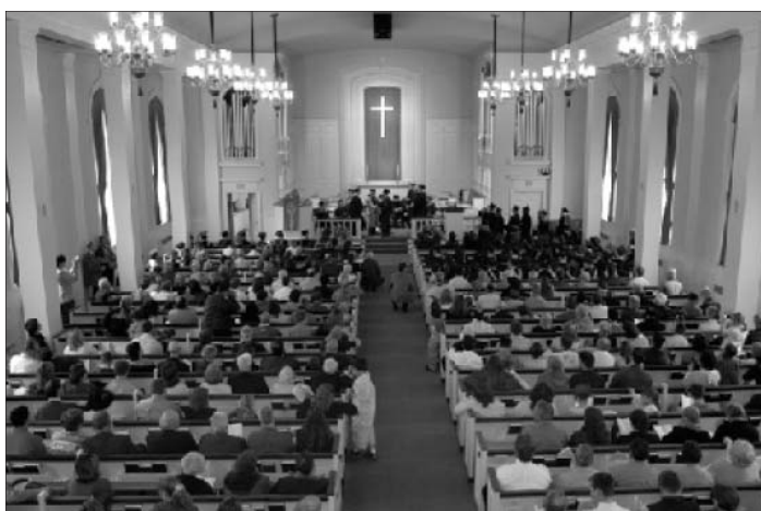
The Woodfords Congregational Church hosted the 148 graduates and 500 guests at the Portland commencement.