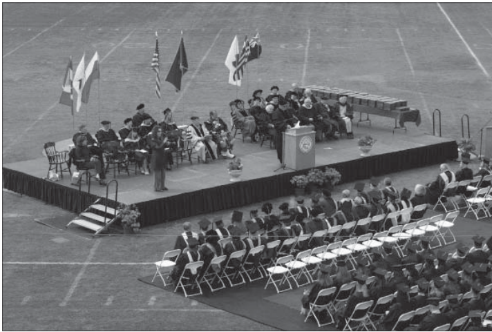
Marked by a beautiful spring day, Husson's first outdoor commencement was attended by more than 2,220 guests

148 Students Receive Degrees in Portland