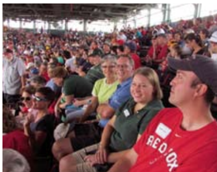
Husson alumni in the stands