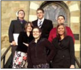
Six students from the School of Science & Humanities traveled to

Union College of Schenectady, New York in November to compete in the Northeast Regional Ethics Bowl. Teams from fourteen universities and colleges took